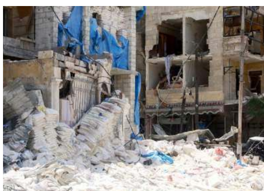
Figure 1: Al Quds hospital post-attack.