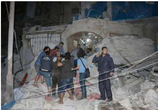
Figure 19: Rescue groups respond to the attack on Al Quds hospital the night of 27 April 2016.

According to three hospital staff that were present and survived the attack, at around 9.30pm on 27 April 2016, a building across from Al Quds hospital was hit by an aerial attack. This building was identified as Ain Jalout school, which had been previously hit at least three times. Those without visibility outside of the hospital at the time refer to this strike as happening close to the hospital, but did not see where it hit. The already damaged school was destroyed. Following the first strike, Al Quds medical staff went to retrieve the wounded and transferred them to the hospital for medical care. An Al Quds staff member, at the residence for hospital personnel located a few buildings down from Al Quds, heard the strike and rushed to the hospital. Soon after the staff member left the residence, the residence was struck by a second air strike.