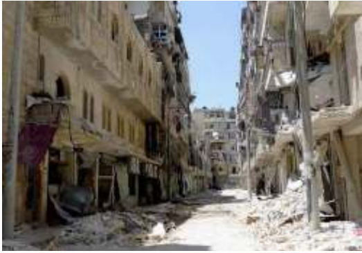
Figure 13: Aleppo City in April 2013.