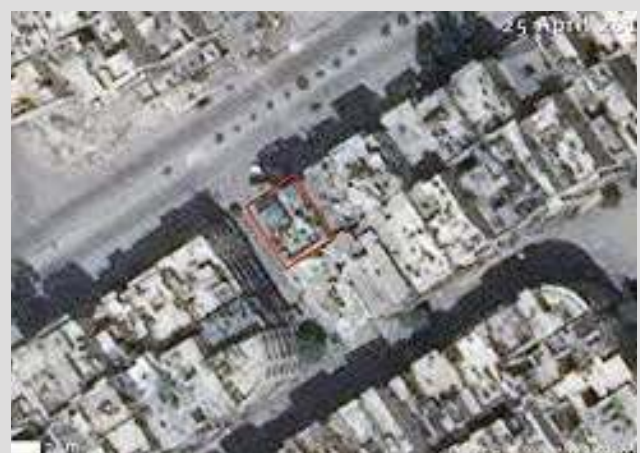
Figure 29: Satellite imagery of Al Quds hospital on 25 April 2016 indicated by the red box.