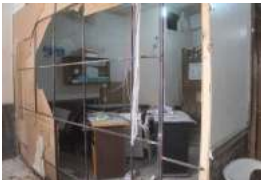
Figure 25: Interior of Al Quds hospital post-attack.

The hospital's donors, including MSF, committed to supporting the hospital's rehabilitation. Because of internal and external constraints, among them humanitarian access to East Aleppo, Al Quds did not receive all rehabilitation equipment and materials until the end of July 2016.