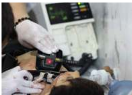
Figure 15: Children await treatment at Al Quds hospital.