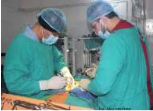
Figure 17: Al Quds' doctors perform surgery on a patient.

The hospital takes many referrals from surrounding facilities because it is among the few specialized hospitals in the area