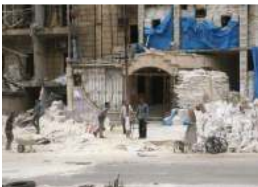
Figure 26: Local rehabilitation efforts post-attack.