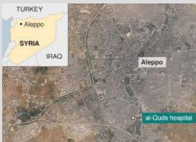
Figure 28: Map indicates Al Quds hospital's location in East Aleppo.