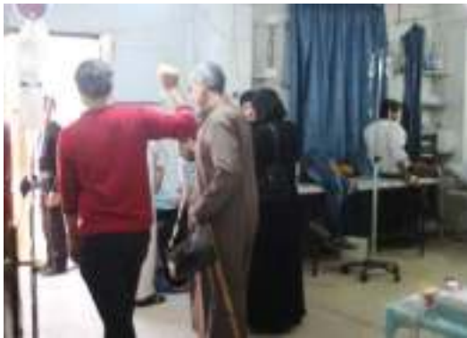
Figure 18: Inside Al Quds Hospital.

Since 2013, Al Quds has been East Aleppo's ONLY cardiology, neurology and pediatric ICU provider, as well as a main referral hospital for pediatrics, internal medicine, ICU and gynecology/obstetrics. According to Al Quds's doctors, it was the first gynecological hospital in East Aleppo after the start of the war. The additional specialized services were added in 2014 in response to the community's increasing health needs. The hospital takes many referrals from surrounding facilities because it is among the few specialized hospitals in the area. It has a full service diabetes and dialysis center, which generally sees 25-30 chronic disease patients daily. The hospital performs an estimated 10 surgeries a day, as well as 5 deliveries. The ICU was always at 100% occupancy and its nursery at approximately 80% occupancy. On average, Al Quds saw 5,000 cases monthly and provided services free of charge. Most patients are poor and could not receive treatment if Al Quds charged for its services. Although these figures are estimations that could not be cross-checked with official medical records, they are consistent with MSF's understanding of the hospital's activities since December 2012.