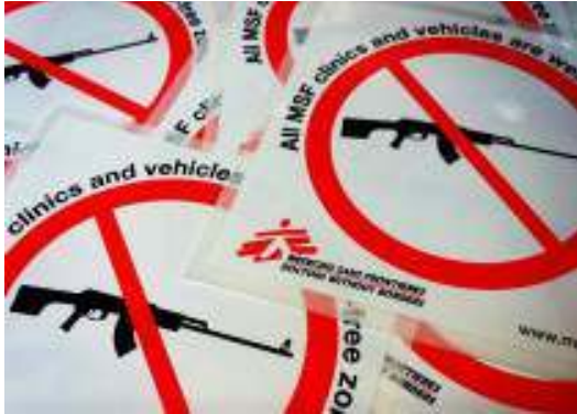
Figure 27: MSF's trademark stickers denoting weapons are not allowed within health facilities.